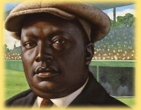
Rube Foster Owner, Negro National League